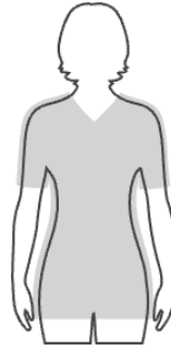
MODERN FIT / SEMI-FITTED

Designed to sit close to the body and more fitted at the waist.